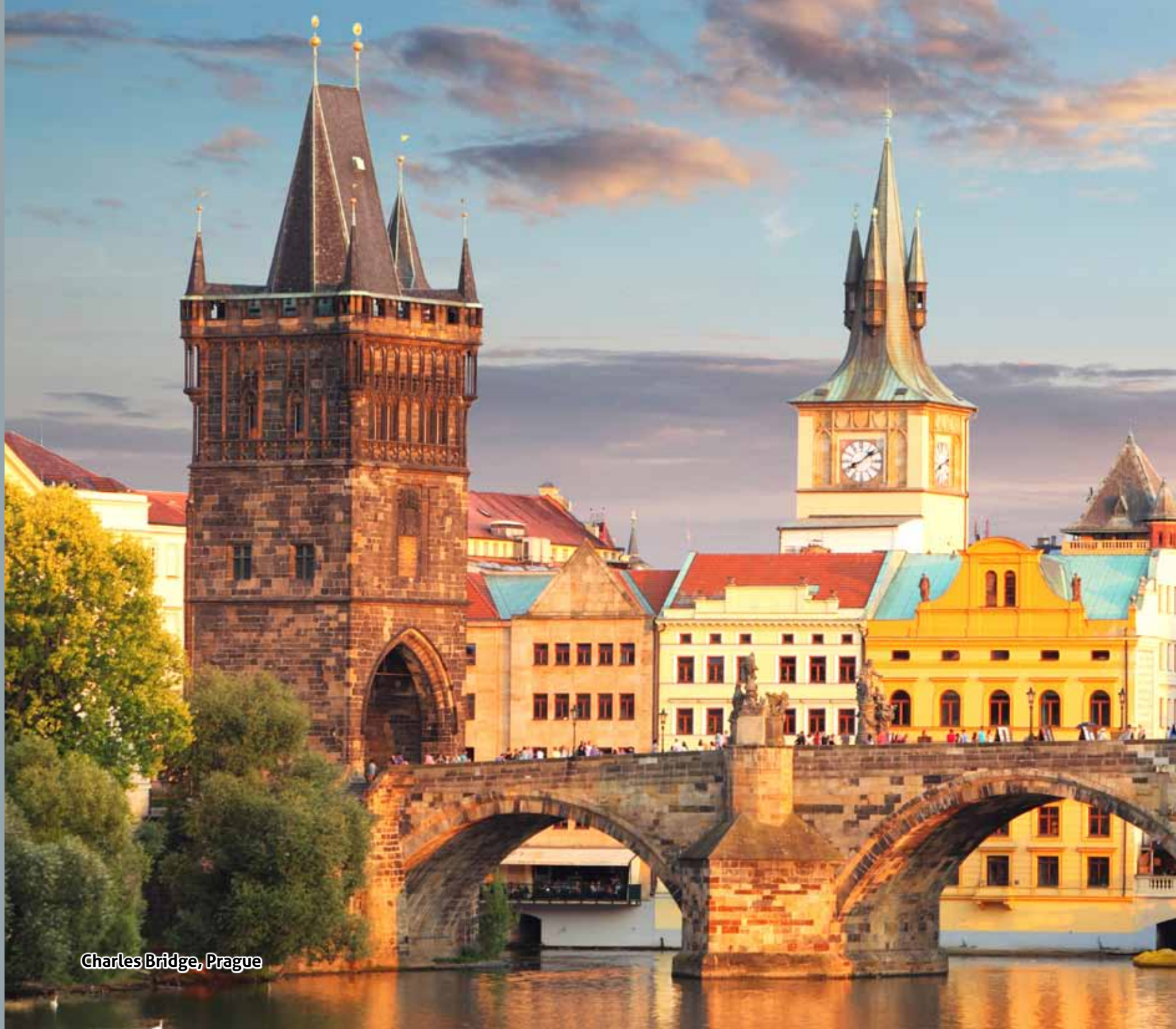
Charles Bridge, Prague