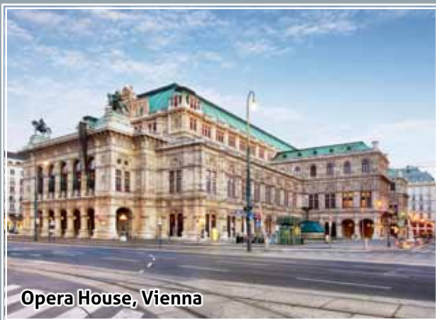
Opera House, Vienna

After continental buffet breakfast, we proceed to Budapest the capital of Hungary. This afternoon lunch is on your own. On arrival in Budapest we proceed on a guided tour of this