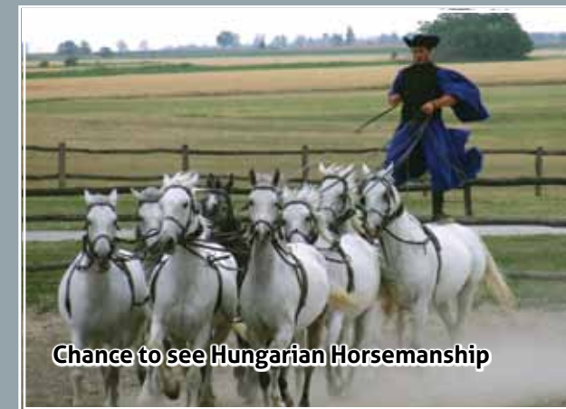
Chance to see Hungarian Horsemanship

(Please note few groups will depart from Vienna and a few groups will depart from Prague.)