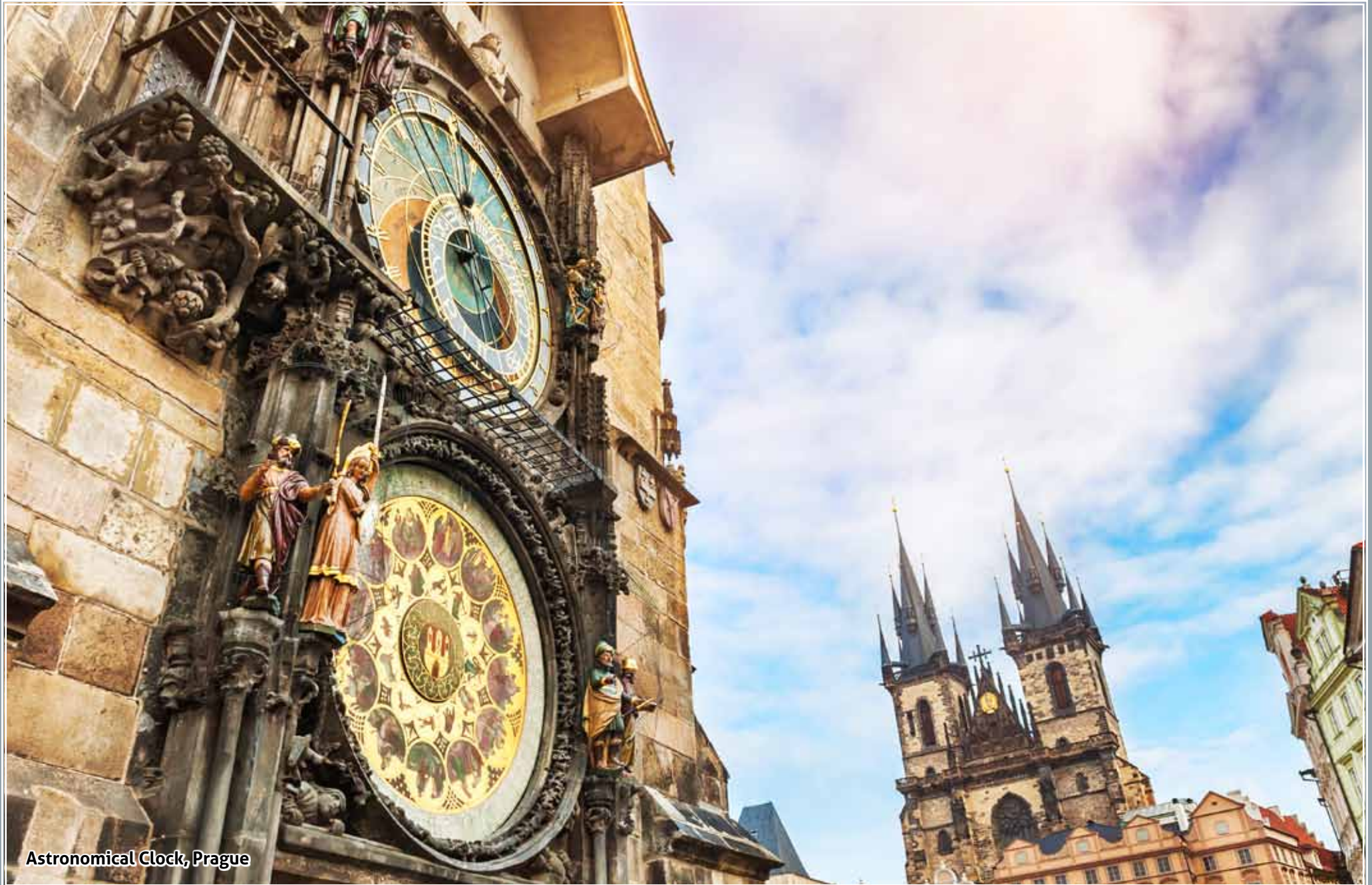
Astronomical Clock, Prague