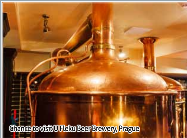
Chance to visit U Fleku Beer Brewery, Prague

vibrant city with an experienced local guide. See the statue of St. Stephen on horseback and experience the domination of the seven turrets. Visit the enormous Heroes Square filled with history. We also see the beautiful Chain Bridge that connects the cities of Buda and Pest. Today lunch is on your own. Rest of the day is free OR join us on Hungarian Experience tour with local lunch. Get thrilled by a show of Hungarian Horsemanship. Being a popular sport these trained horses and their masters will leave you awestruck with an amazing display of skill and bravery. This evening you have a chance to experience the Danube river cruise where you will see the Palace in Buda castle, the Chain bridge and the Parliament building lined on the Danube embankment. Later enjoy dinner at an Indian restaurant. Drive back to your hotel.